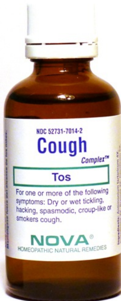
Cough Complex Bottle Label