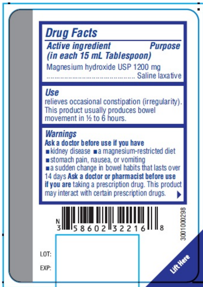
Top Ply (Page #1)