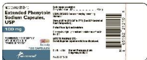
Label 100 ct.