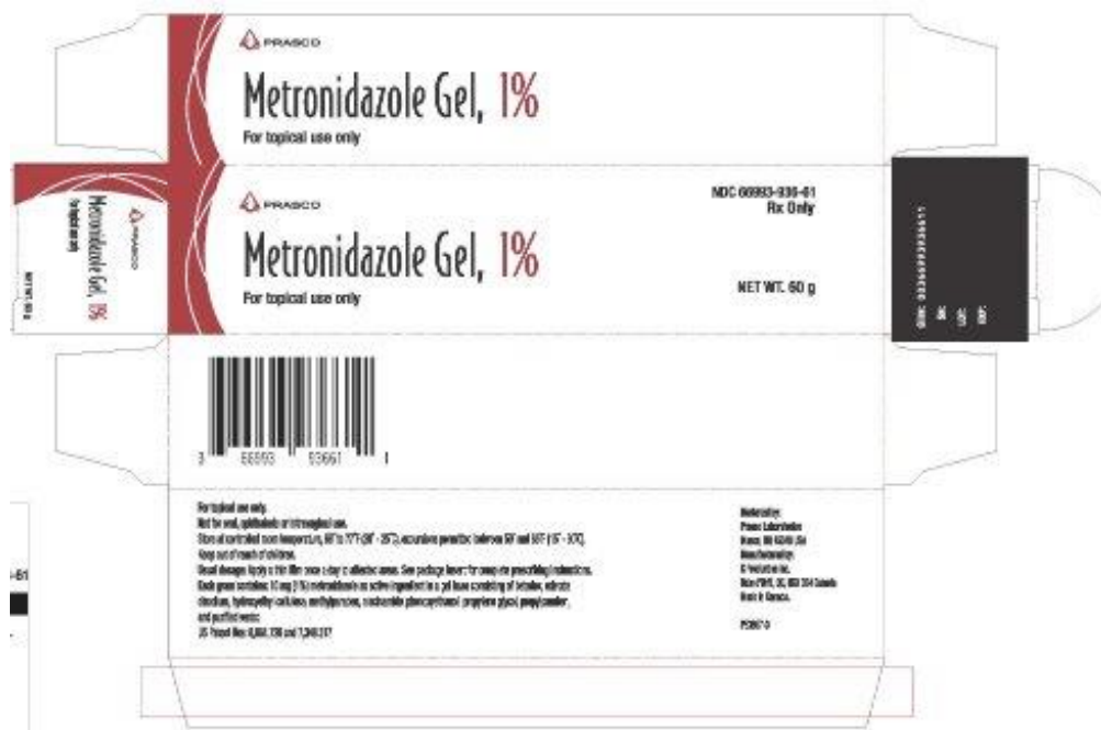
Metronidazole Gel, 1% Carton