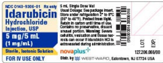
Idarubicin Hydrochloride Injection 5 mg/5 mL Vial Label