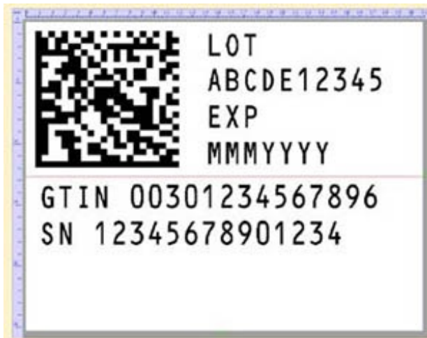
Representative Carton Serialization Image