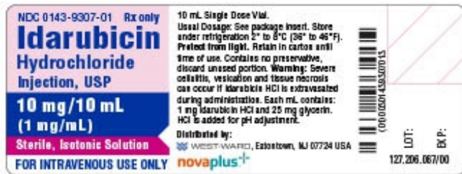
Idarubicin Hydrochloride Injection 10 mg/10 mL Vial Label