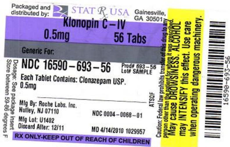
KLONOPIN 0-5MG LABEL IMAGE

Store at 25°C (77°F); excursions permitted to 15° to 30°C (59° to 86°F).