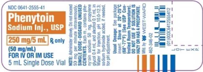
PRINCIPAL DISPLAY PALEL, SERIALIZED LABEL