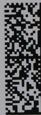
51662-1269-3 Serialized Case Labeling