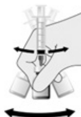
Figure 3. Shake the vial well until the powder is completely