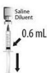
Figure 1. Cleanse both vial stoppers. Using a graduated syringe, withdraw 0.6 mL of Sterile Saline Diluent from accompanying vial.