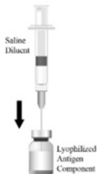
Figure 2. Cleanse the Lyophilized Antigen Component vial stopper. Transfer the entire contents of the prefilled syringe into the vial.

Figure 1. Hold the ungraduated prefilled syringe of Sterile Saline Diluent by the barrel and unscrew the syringe cap by twisting it counterclockwise. Align the needle to the axis of the syringe and attach by gently connecting the needle hub into the Luer Lock Adaptor (LLA) and rotate a quarter turn clockwise until you feel it lock.