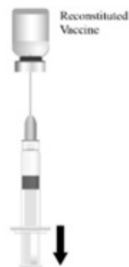
Figure 4. After reconstitution, withdraw the entire contents of reconstituted vaccine into the same syringe and after changing the needle administer the vaccine intramuscularly .

Figure 3. Shake the vial well until the powder is completely dissolved.