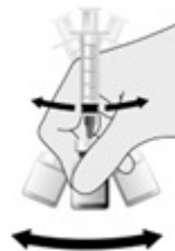
Figure 3. Shake the vial well until the powder is completely dissolved.

Figure 2. Transfer 0.6 mL Sterile Saline Diluent into Lyophilized Antigen Component vial.