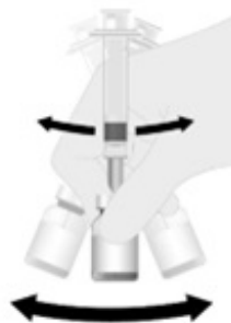
Figure 3. Shake the vial well until the powder is completely dissolved.

Figure 2. Cleanse the Lyophilized Antigen Component vial stopper. Transfer the entire contents of the prefilled syringe into the vial.