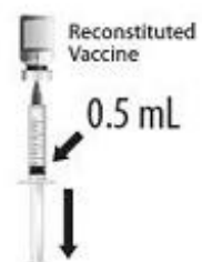
Figure 4. After reconstitution, withdraw 0.5 mL of reconstituted vaccine into the same syringe and administer intramuscularly .

Figure 3. Shake the vial well until the powder is completely dissolved.