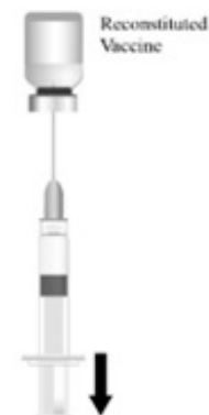
Figure 4. After reconstitution, withdraw the entire contents of reconstituted vaccine into the same syringe and after changing the needle administer the vaccine intramuscularly .

Figure 3. Shake the vial well until the powder is completely dissolved.