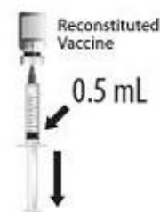
Figure 4. After reconstitution, withdraw 0.5 mL of reconstituted vaccine