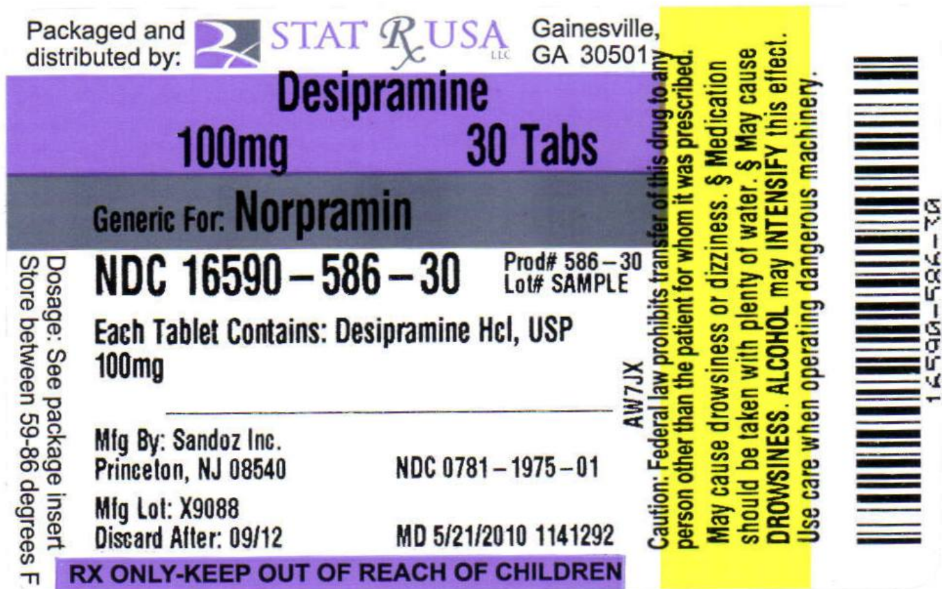
DESIPRAMINE 100MG LABEL IMAGE