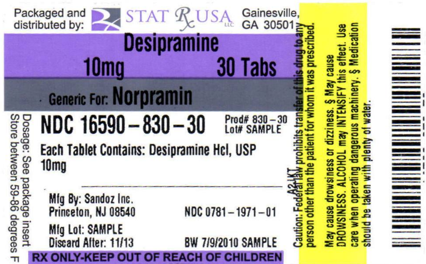
DESIPRAMINE 10MG LABEL IMAGE