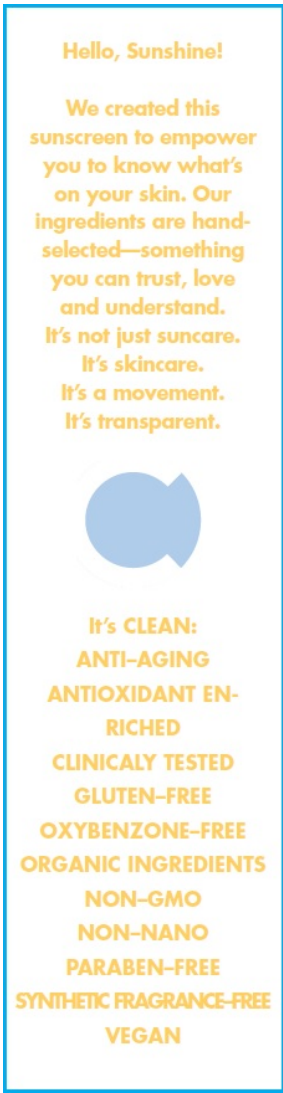
LEFT SIDE 5.313" X 1.375"