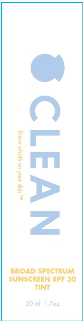
FRONT 5.313" X 1.375"