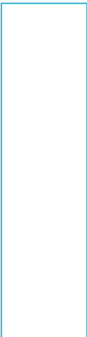
RIGHT SIDE BLANK 5.313" X 1.375"