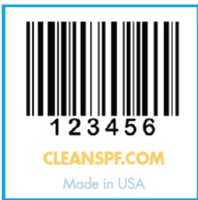
BOTTOM 1.375" X 1.375"