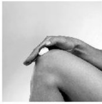
Figure E: Cover affected area with thin layer of Clobetasol Propionate Emulsion Foam. Rub foam gently into affected skin.

6. Avoid getting Clobetasol Propionate Emulsion Foam in or near your mouth, eyes, or vagina; if contact happens, rinse well with water. Wash your hands well after applying Clobetasol Propionate Emulsion Foam (excluding affected areas of hands).