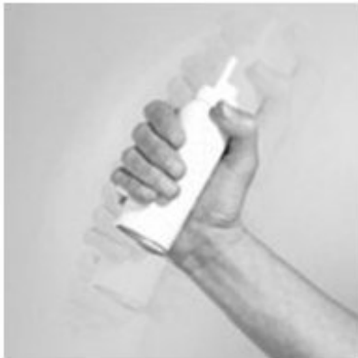
Figure B: Shake the can of Clobetasol Propionate Emulsion Foam.

3. Turn the can of Clobetasol Propionate Foam upside down and press the nozzle. See Figure C.