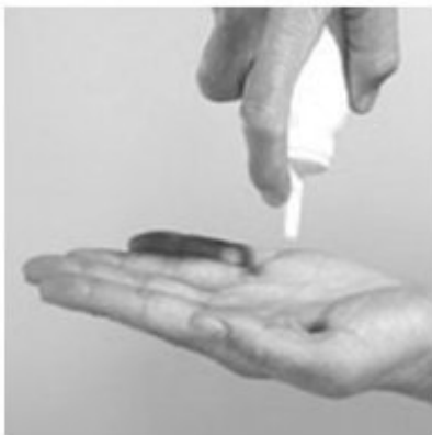
Figure C: Turn the can of Clobetasol Propionate Emulsion Foam upside down and press nozzle.

3. Turn the can of Clobetasol Propionate Foam upside down and press the nozzle. See Figure C.