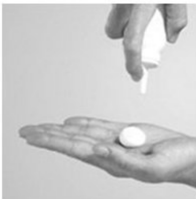
Figure D: Dispense Clobetasol Propionate Emulsion Foam into hand.

4. Dispense a small amount of Clobetasol Propionate Emulsion Foam into the palm of your hand. See Figure D.