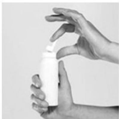
Figure A: Break tiny plastic piece on the nozzle of the can of Clobetasol Propionate Emulsion Foam. 2. Shake the can of Clobetasol Propionate Emulsion Foam before use.

1. Before applying Clobetasol Propionate Emulsion Foam for the first time, break the tiny plastic piece at the base of the can's rim by gently pushing back (away from the piece) on the nozzle. See Figure A.