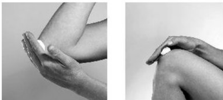
Figure E: Cover affected area with thin layer of Clobetasol Propionate Emulsion Foam. Rub foam gently into affected skin.

6. Avoid getting Clobetasol Propionate Emulsion Foam in or near your mouth, eyes, or vagina; if contact happens, rinse well with water. Wash your hands well after applying Clobetasol Propionate Emulsion Foam (excluding affected areas of hands).