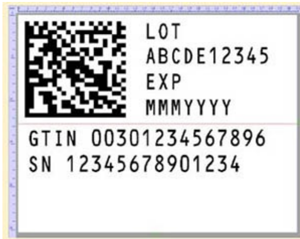
Representative Carton Serialization Image