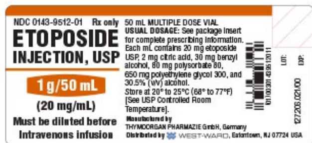
Vial label for Etoposide Injection, USP 1 g/50 mL