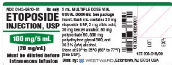
Vial label for Etoposide Injection, USP 100 mg/5 mL