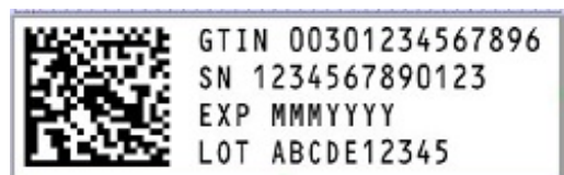
Representative Carton Serialization Image