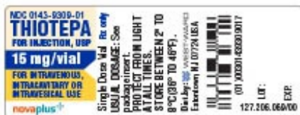
Thiotepa for Injection, USP vial label image