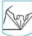
Teat Spray Roceador de tetina