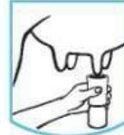
Teat Dip Baño de tetina

Read other label for directions for use, first aid and precautionary statements Lea la otra etiqueta para direcciones de uso, primeros auxilios y medidas preventivas