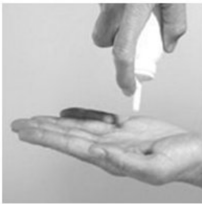
Figure C: Turn the can of OLUX-E Foam upside down and press nozzle.

3. Turn the can of OLUX-E Foam upside down and press the nozzle. See Figure C.