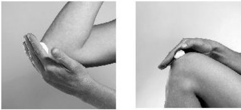
Figure E: Cover affected area with thin layer of OLUX-E Foam. Rub foam gently into affected skin.

6. Avoid getting OLUX-E Foam in or near your mouth, eyes, or vagina; if contact happens, rinse well with water. Wash your hands well after applying OLUX-E Foam (excluding affected areas of hands).