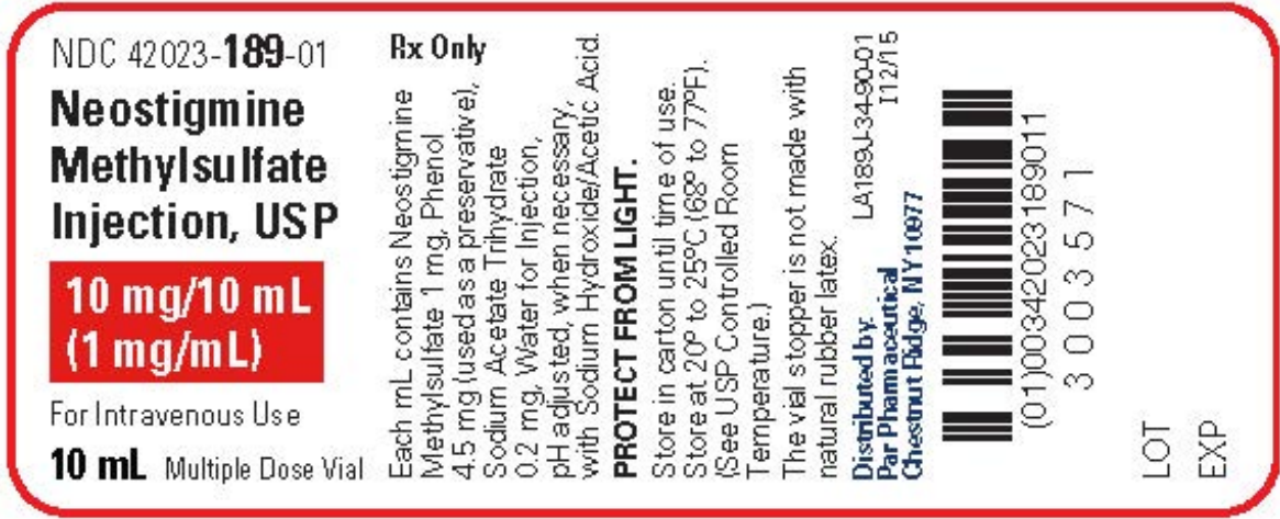
10 mg/10 mL (1 mg/mL) vial label