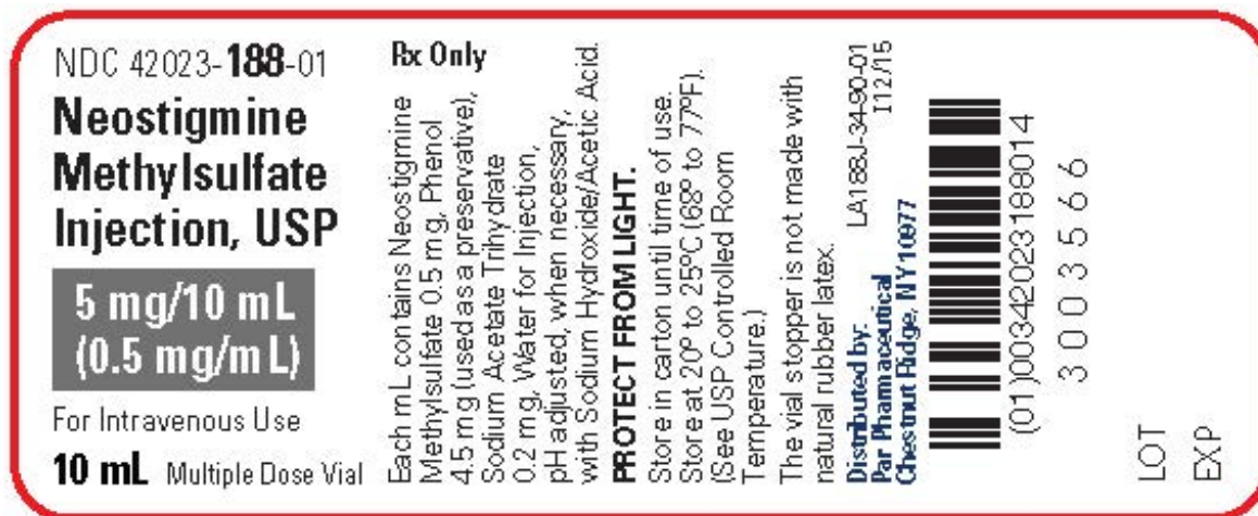
5 mg/10 mL (0.5 mg/mL) vial label