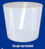
Dose cup included