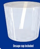
Dose cup included