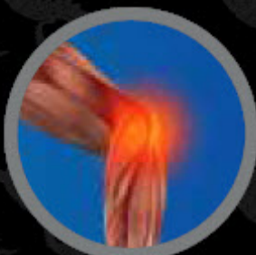
ELBOWS / CODOS