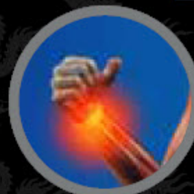
WRISTS / MUÑECAS