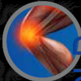
KNEES / RODILLAS