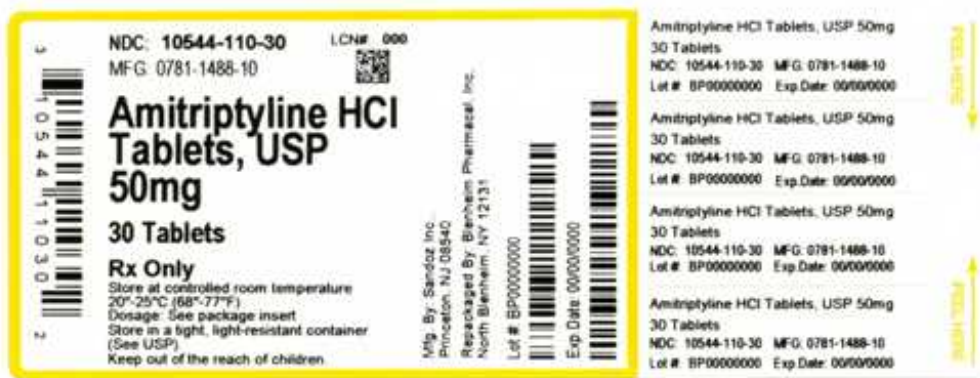
10544-110-30 Bottle Label