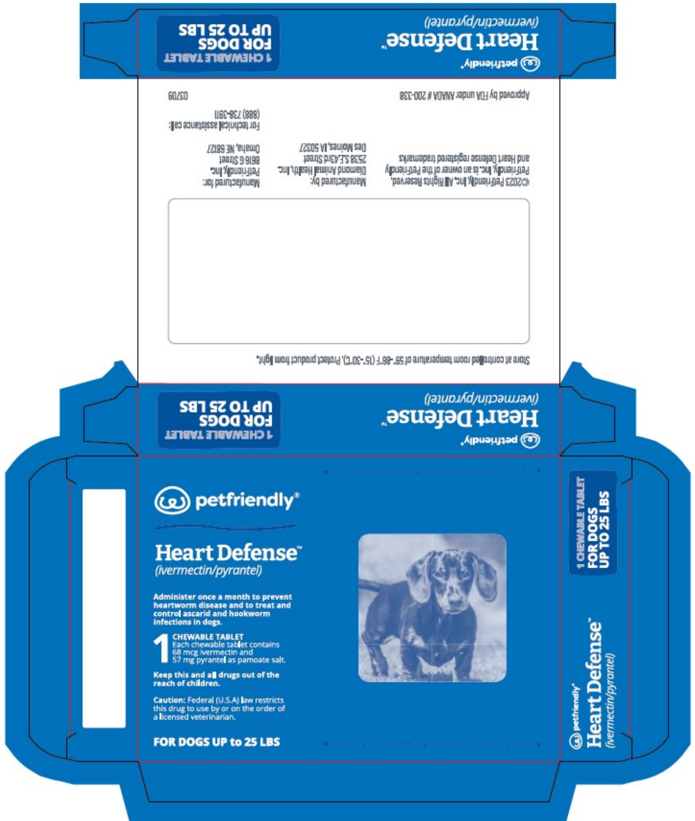
Principal Display Panel - 1 Unit Blister Pack in Unit Carton for Dogs 26 to 50 lbs