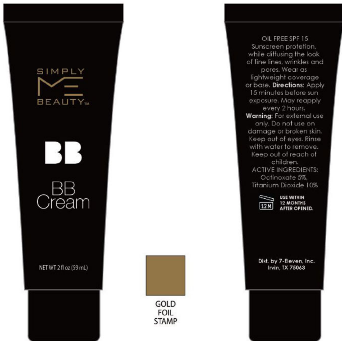
BB Cream Medium with Spf 15 - Sunscreen. Drug Fact section - packagingouter2 label packagingouter2