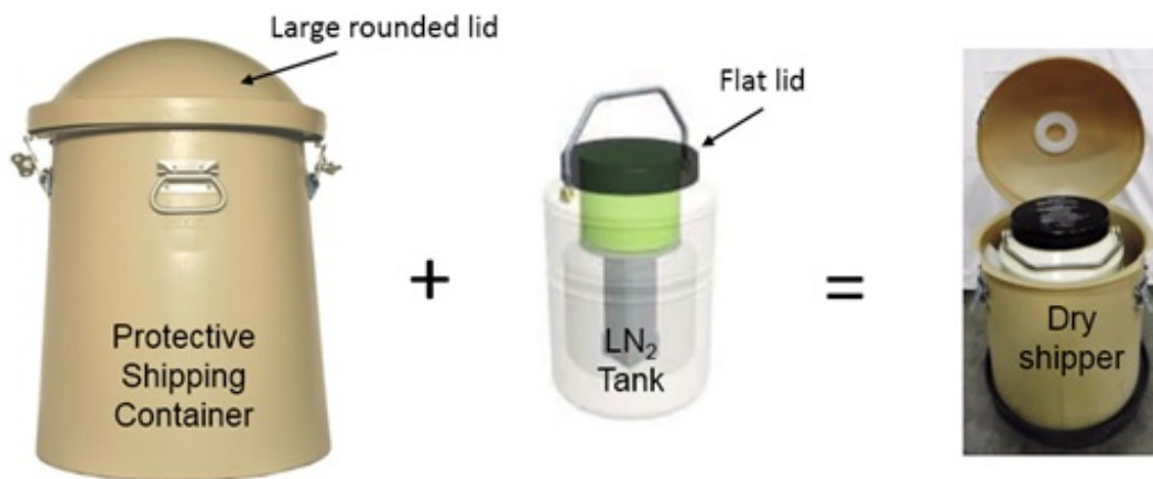
Figure 1: Dry shipper components and configuration

CLEVECORD is shipped frozen inside a steel canister placed inside a liquid nitrogen (LN 2 ) charged tank specifically designed to keep the temperature at or below -150°C (dry shipper). Dry shippers consist of a protective shipping container with a large rounded lid, carrying a LN 2 tank with a flat lid (see Figure 1). CLEVECORD must be stored at or below -150°C either in the LN 2 tank inside the dry shipper for short-term storage (up to 48 hours), or inside a LN 2 -cooled storage device at the Transplant Center for storage greater than 48 hours. Recharge the tank with fresh LN 2 if CLEVECORD is to remain stored in the dry shipper for more than 48 hours.