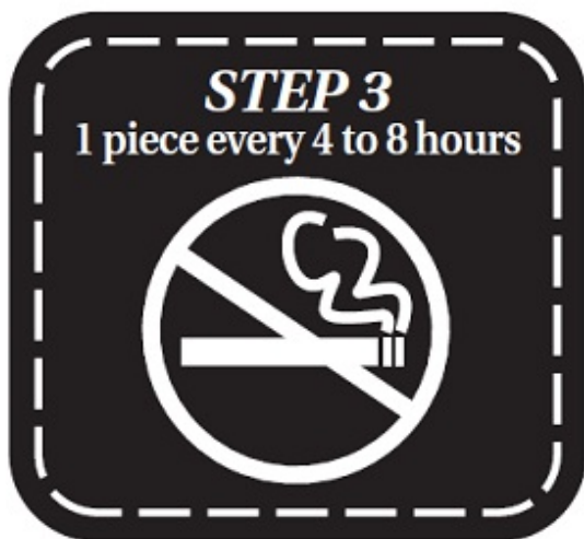
At the Beginning of Week #10