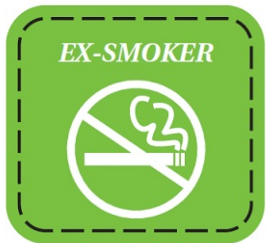
12 Weeks After Quit Date