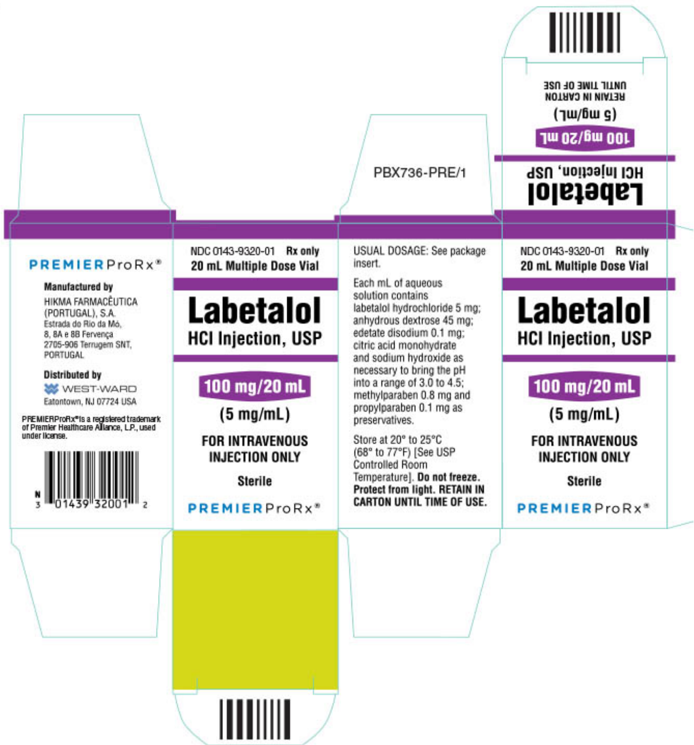
Labetalol HCl Injection, USP 100 mg/20 mL Premier Pro Carton Image