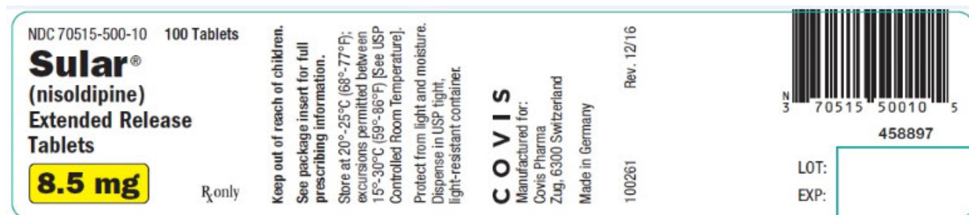
Bottle Label - 8.5 mg