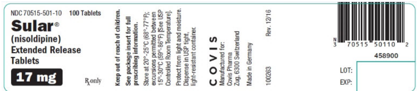
Bottle Label - 17 mg