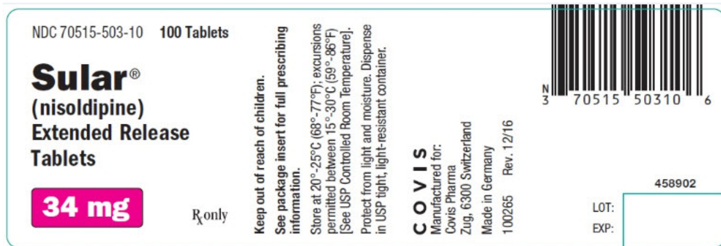
Bottle Label - 34 mg