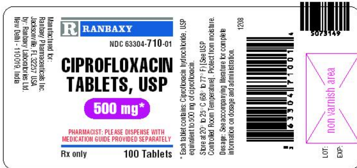
500 mg Bottle Label