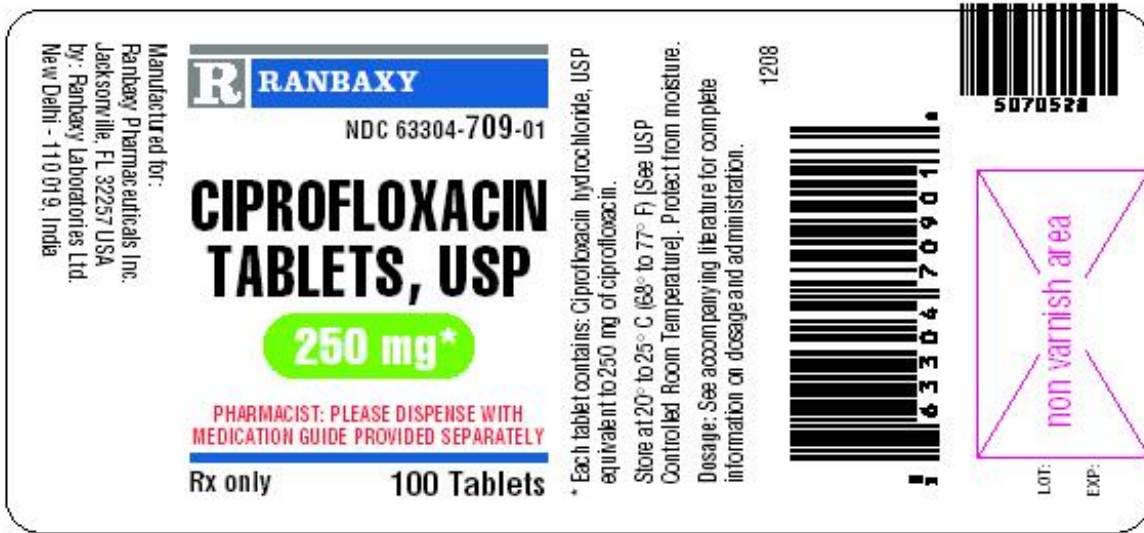
250 mg Bottle Label