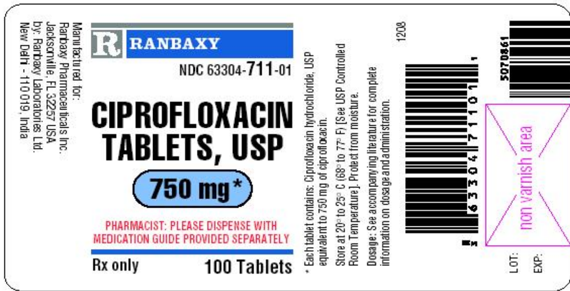
750 mg Bottle Label