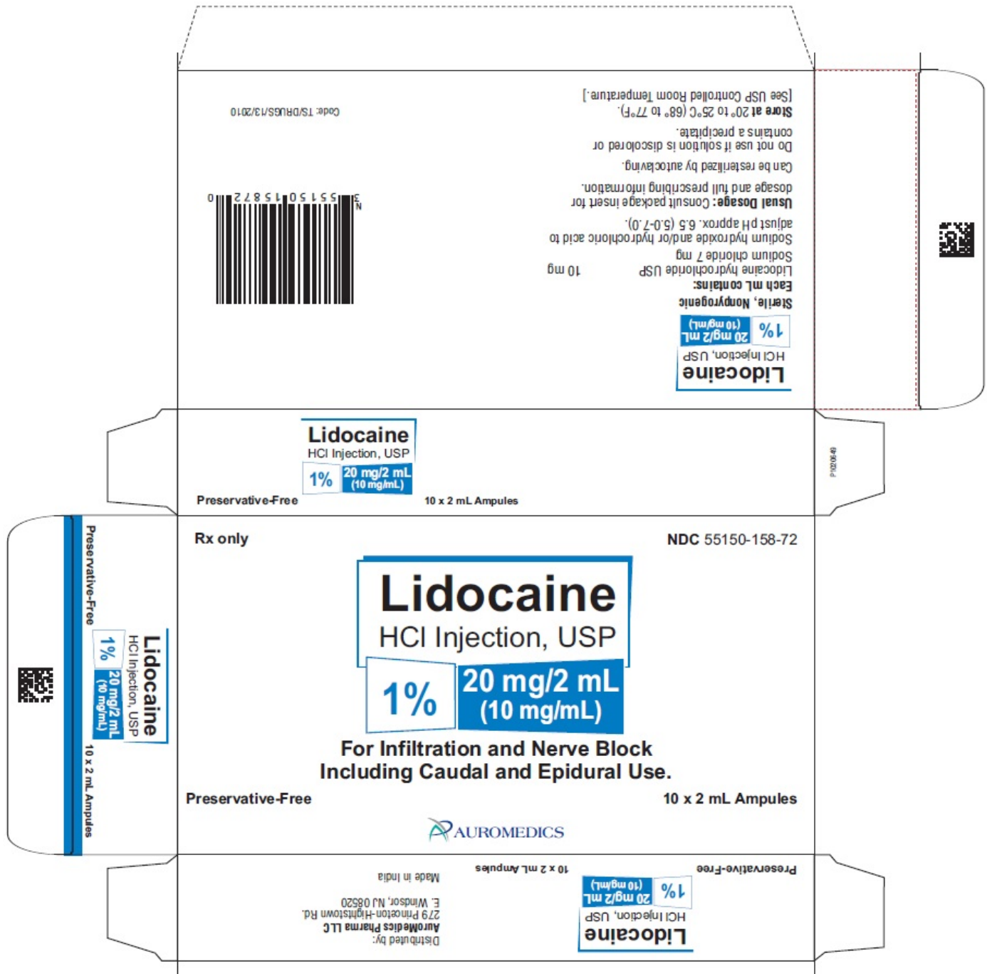
PACKAGE LABEL-PRINCIPAL DISPLAY PANEL - 1% 50 mg/5 mL (10 mg/mL) - 5 mL Ampule Label

Rx only NDC 55150-158-72 Lidocaine HCl Injection, USP 1% 20 mg/2 mL (10 mg/mL) For Infiltration and Nerve Block Including Caudal and Epidural Use. Preservative-Free 10 x 2 mL Ampules AUROMEDICS