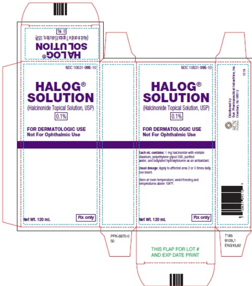
LABEL PRINCIPAL DISPLAY PANEL-Physician Sample