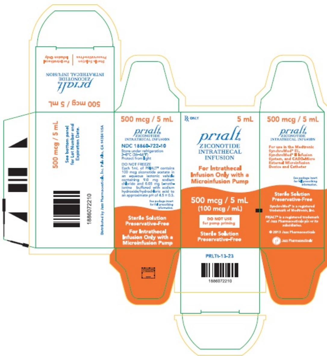
Carton - 5 mL