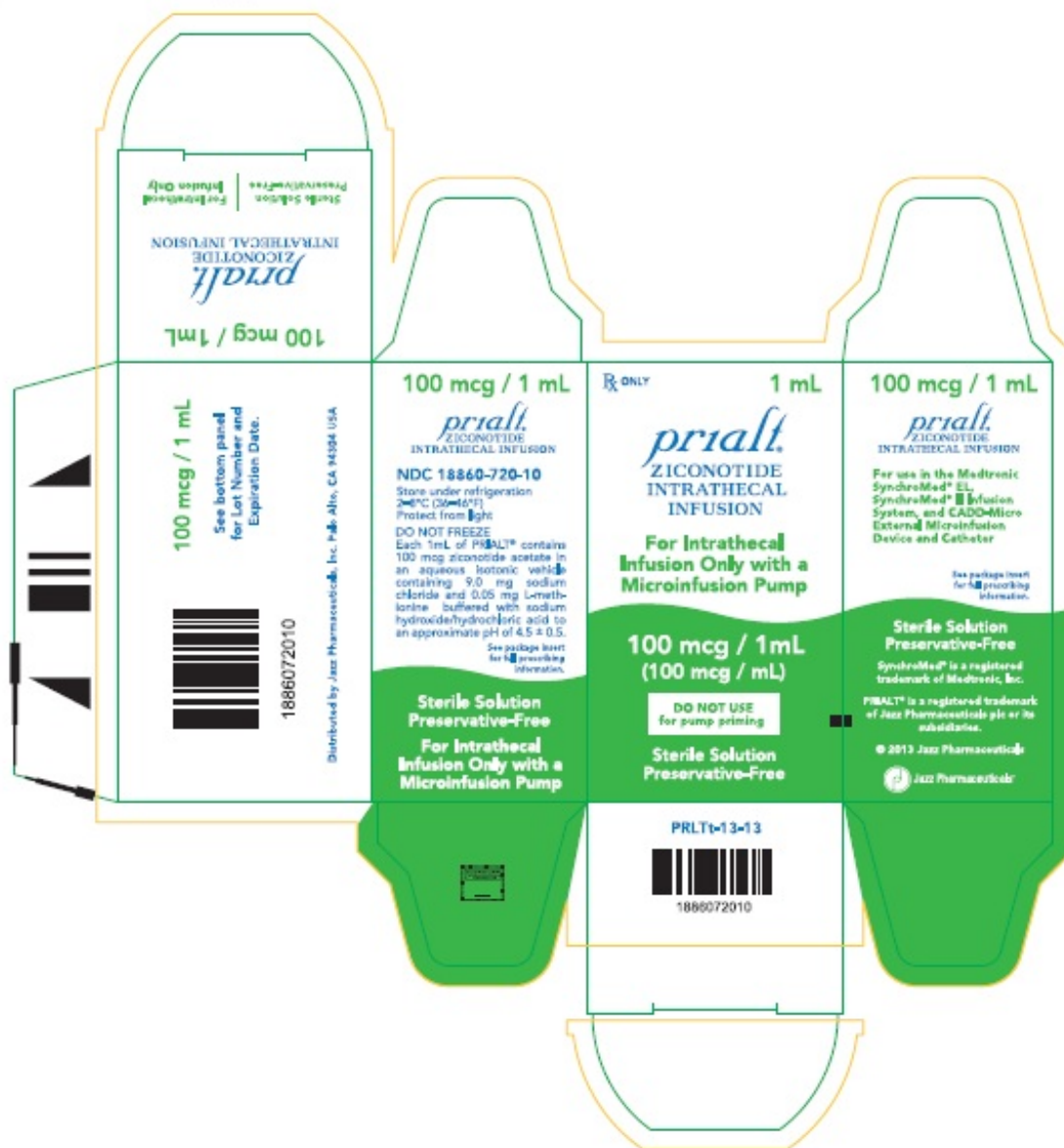
Carton - 1 mL