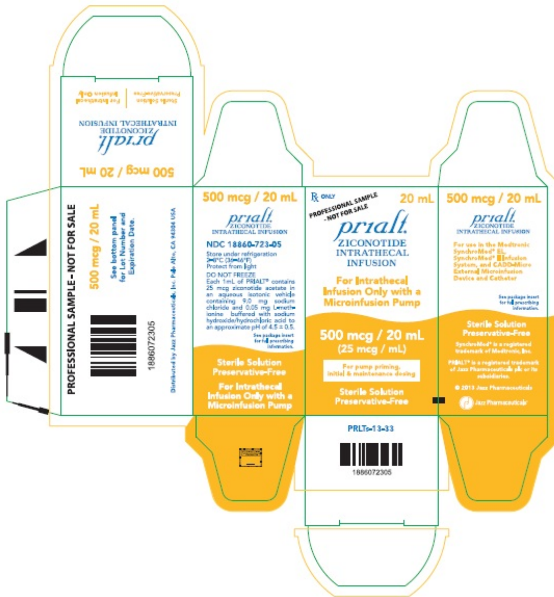
Carton - 20 mL - Sample