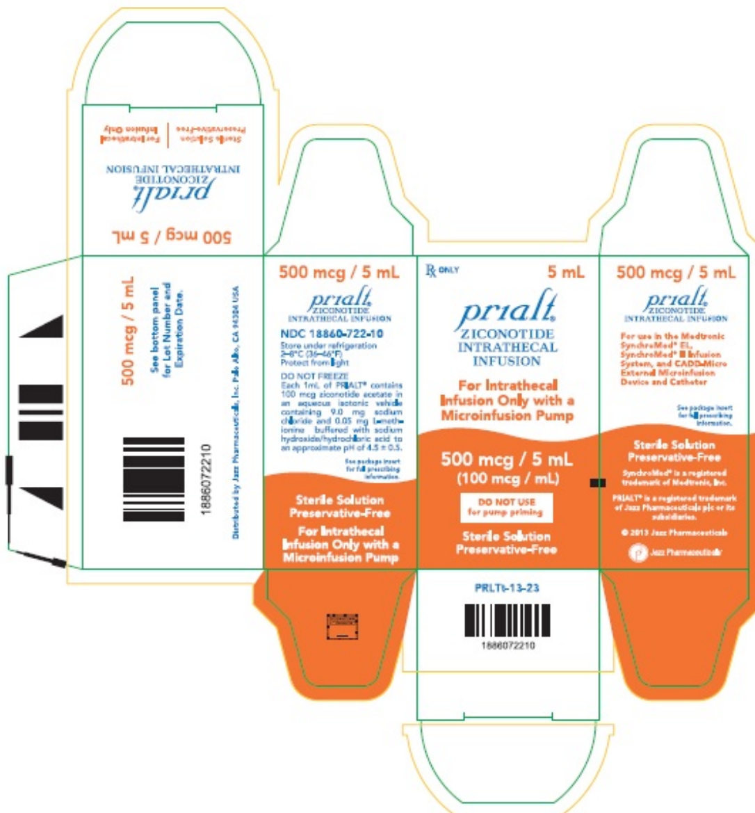
Carton - 5 mL