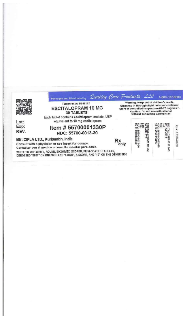
Image of Label

All trademarks are the property of their respective owners.