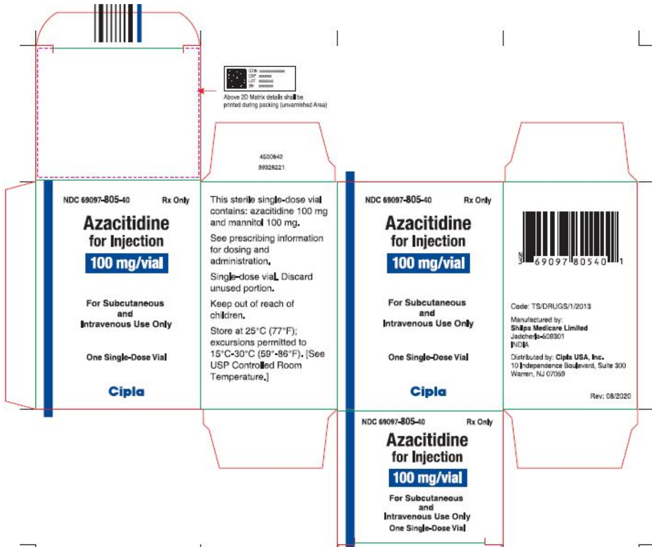
cipla carton label