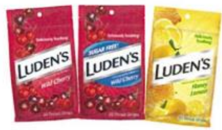
Wild Cherry Sugar Free Wild Cherry Honey Lemon