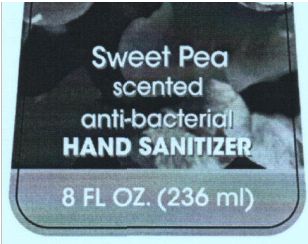
Product Package Label B