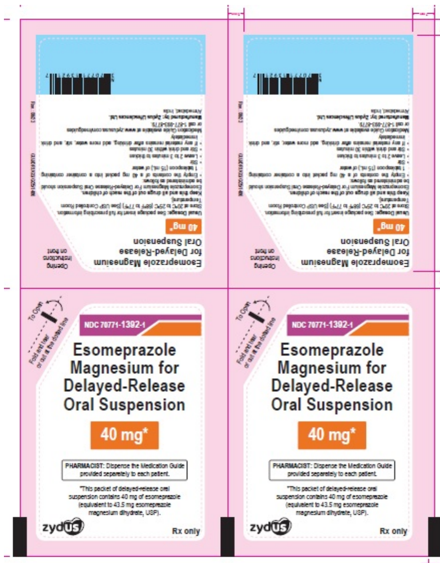
Esomeprazole Magnesium For Delayed-Release Oral Suspension NDC 70771-1392-3 unit dose packages of 30: 40 mg packets Rx Only