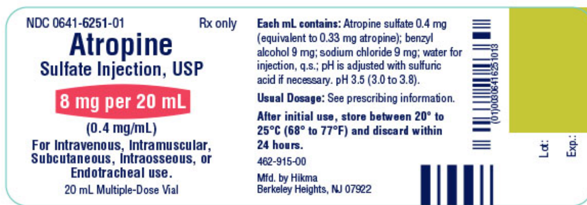
Atropine Sulfate Injection, USP 8 mg per 20 mL Container Label