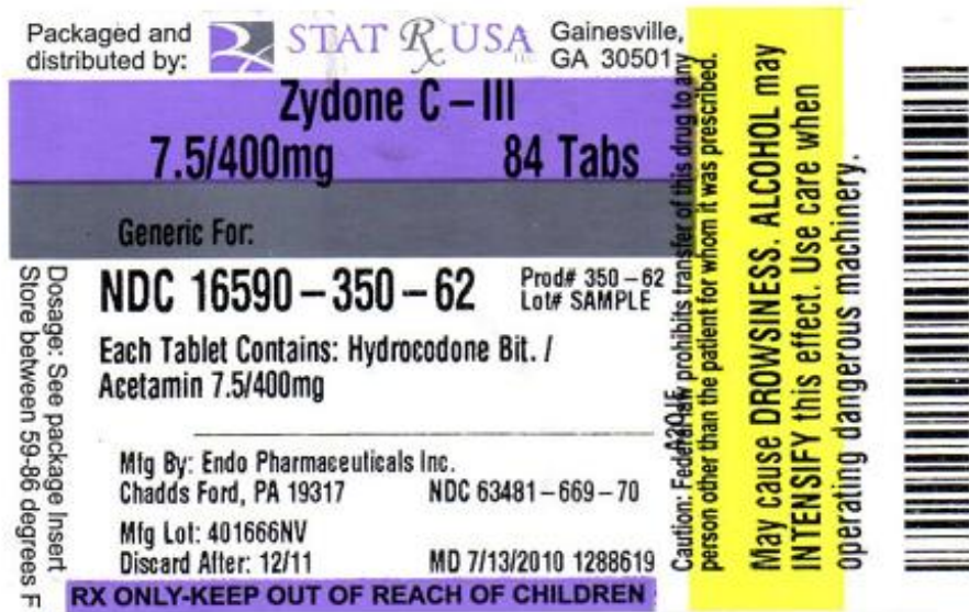
ZYDONE LABEL IMAGE