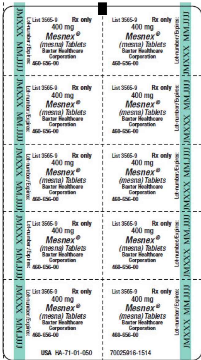
Container Label 400 mg Tablets