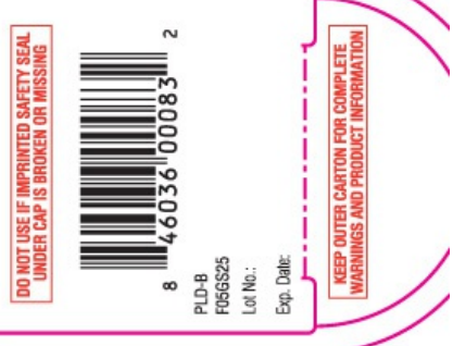
Good Sense Stool Softener Orange Softgel