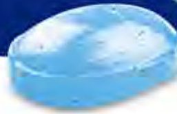
NOT ACTUAL SIZE