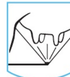
Teat Spray Rocedor de tetina