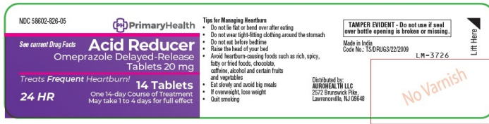
Top Ply (Page #1)