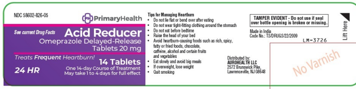
Top Ply (Page #1)