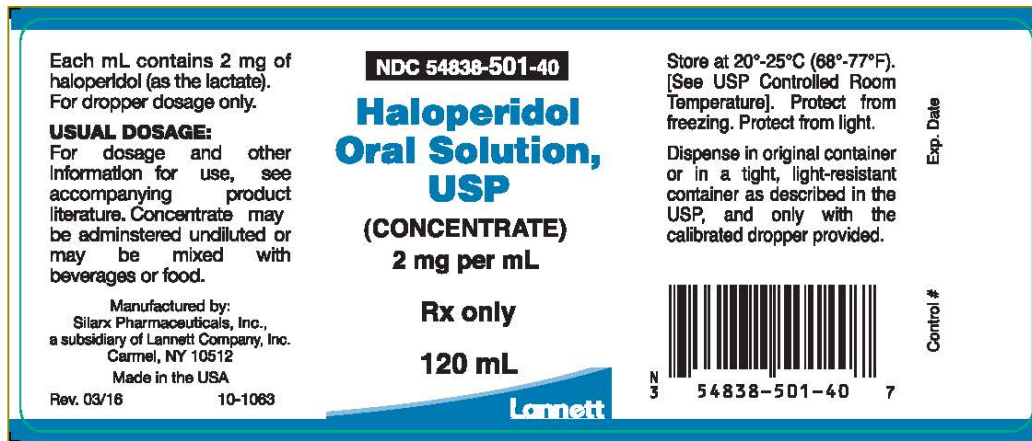
Bottle Label - 120 mL