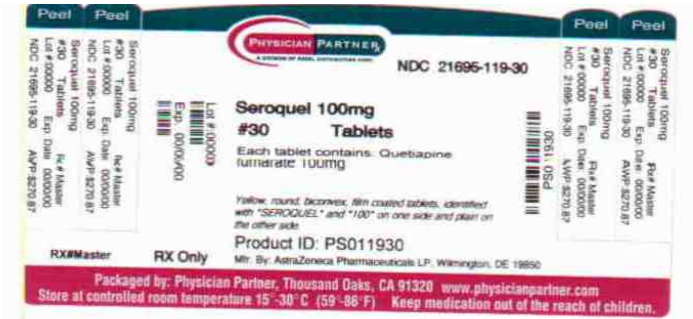
Principal Display Panel