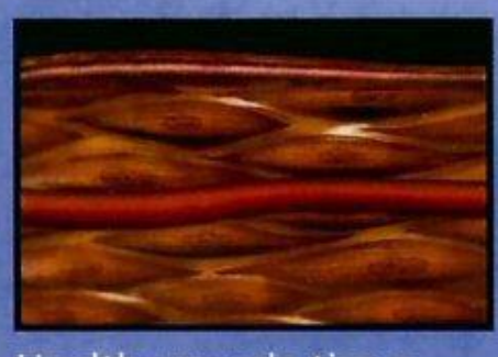
Healthy muscle tissue