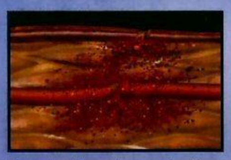
Surgically-cut muscle tissue