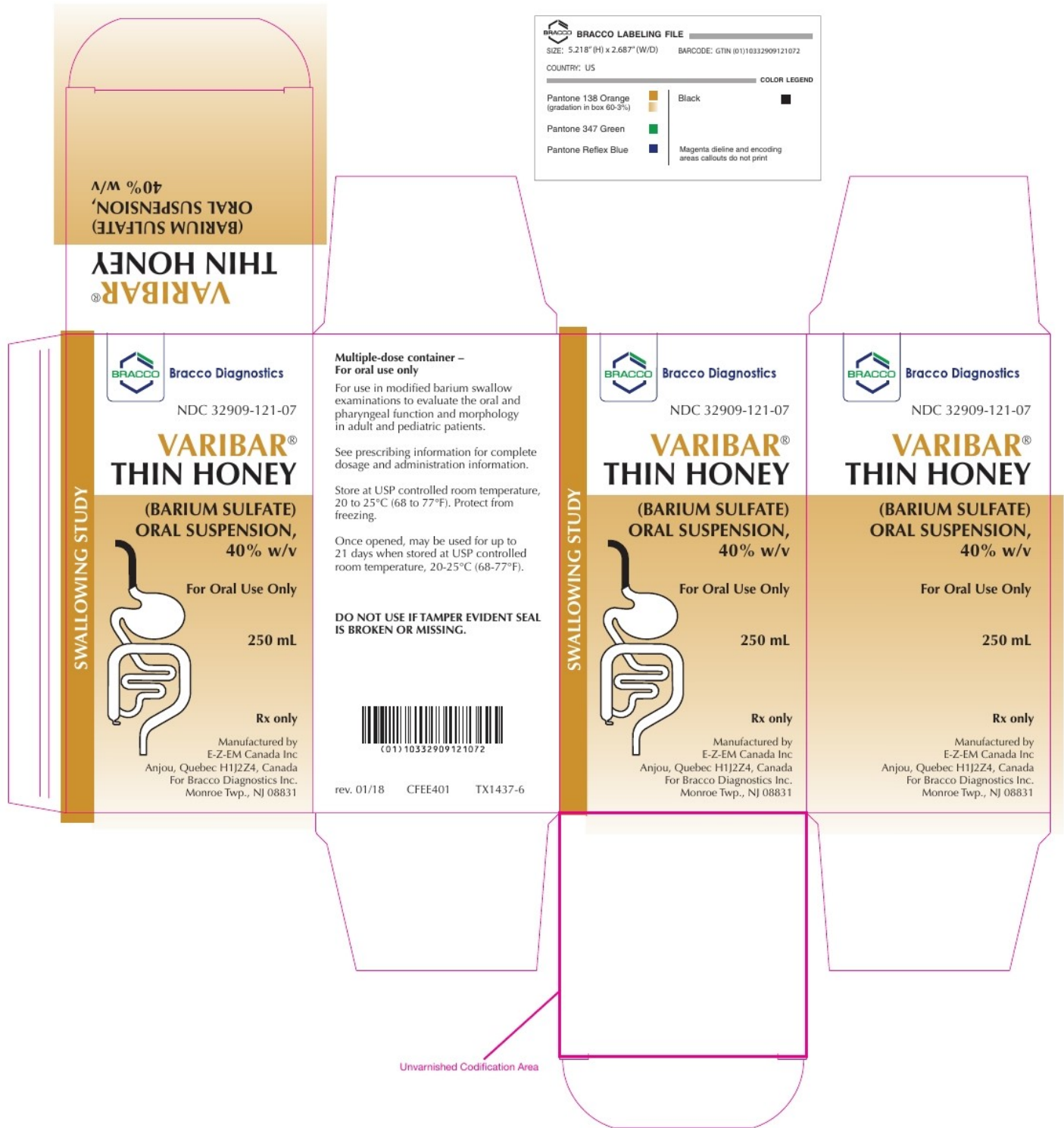
Varibar Thin Honey Unit Label