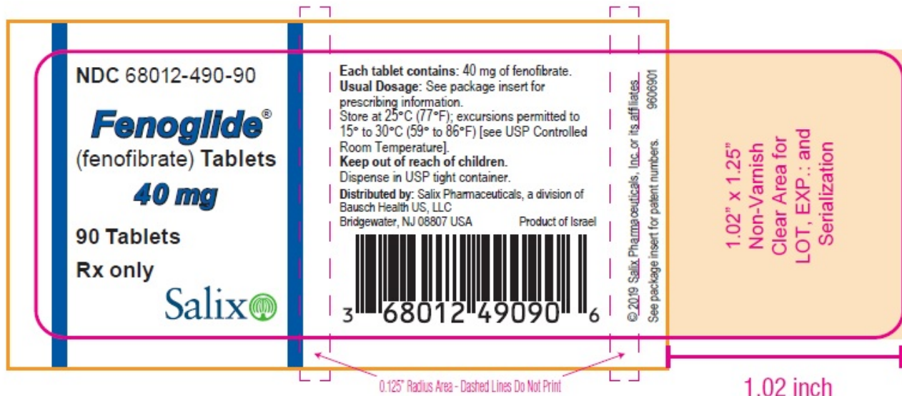
Actual Size Label: Square Bottle