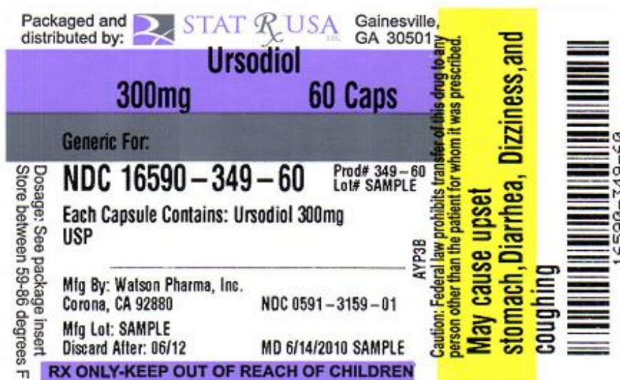
URSODIOL 300MG LABEL